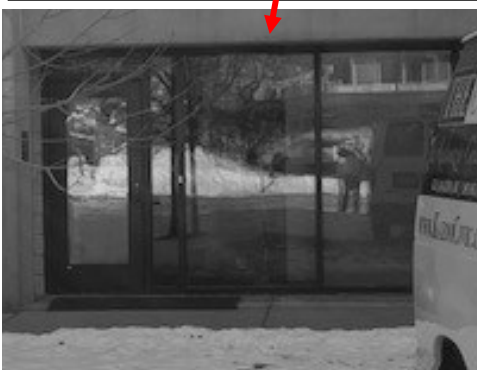
Costume Shop Doors