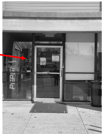
Carver Studio Stage Door